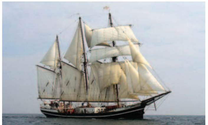
FIG.4: With a hull as good as new and a complete overhaul, the future of the Thor Heyerdahl looks assured.