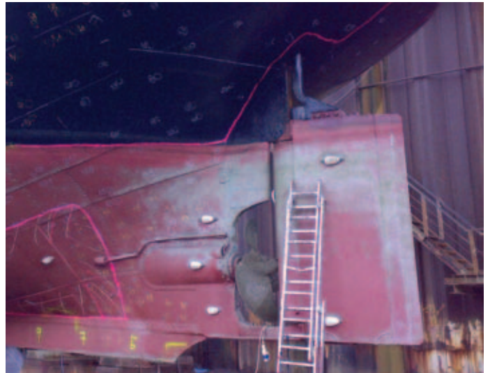
FIG.2: Some 3,000 points and defined lines were scanned during the hull survey

Armed with this essential information, the task of re-plating the hull and refurbishing much of the rest of the vessel will proceed over the next